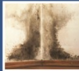
Toxic Black Mold Removal