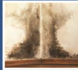
Toxic Black Mold Removal